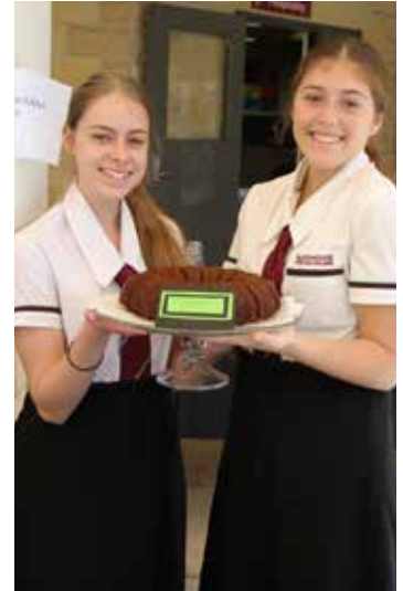
Try a tasty treat in the Hospitality Garden for $2 per plate to support our Fiji Mission.