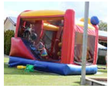
Little ones can work off some energy in the free jumping castle.