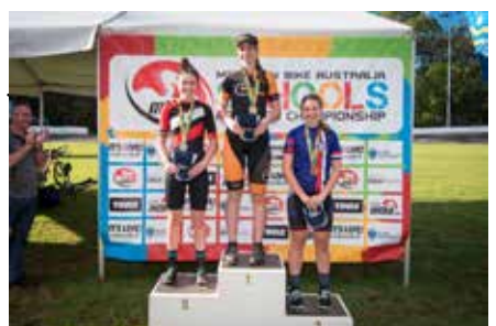
P18 Sports Wrap Up