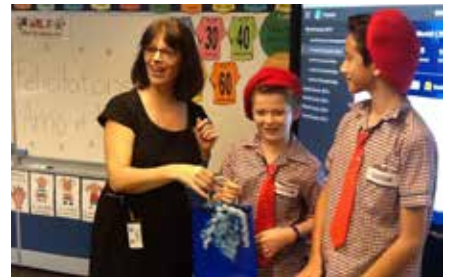
P6 Language Perfect results