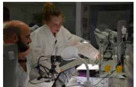
P11 Stem Program