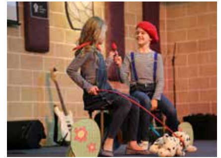
P5 Night of Talent